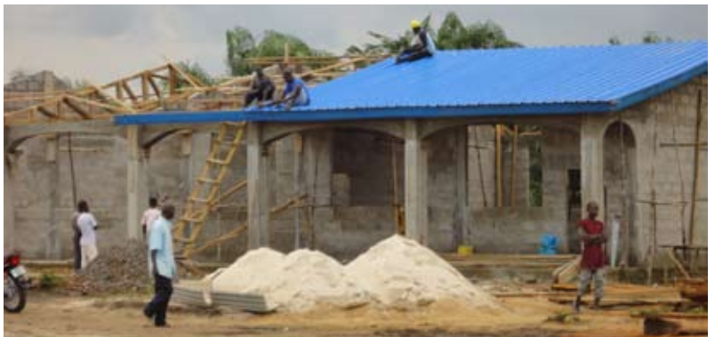
With the installation of the roof on the first classroom building, excitement for the village school grows.