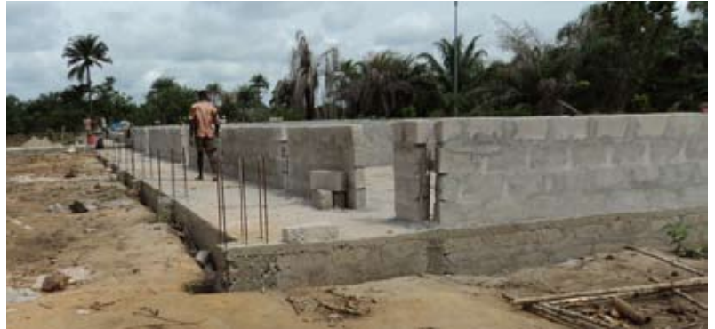
Handmade blocks are put in place, and the walls of the only school in the Madina area grace the landscape.

Much has been accomplished. Now, funds are needed to proceed with the framing and roof of the second classroom building, complete the interiors of the classrooms and start the administrative building. When construction is complete, the school will accommodate 600 children from Madina and surrounding villages. "Who knows what these students may become with an education," says Francis.